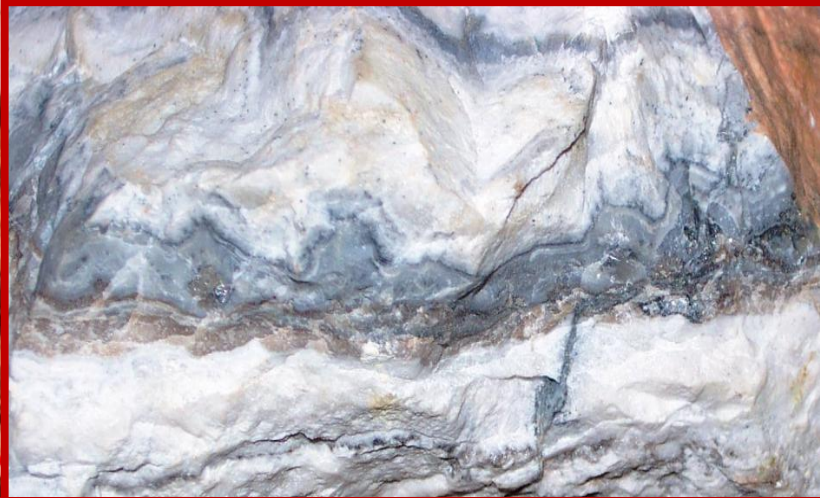
The OreFull Mineral Texture Atlases Volume 39-3: Sleeper High Grade Ores and Pit Face 3 of 3 .