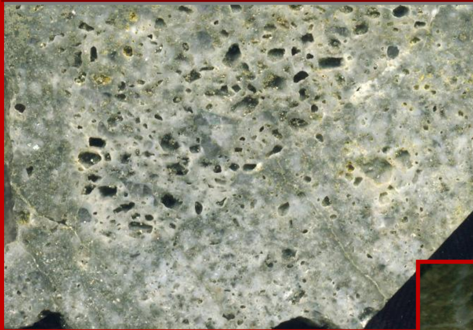
The OreFull Mineral Texture Atlases Volume 45 - 5: Hand Specimens of Lepanto HSE 1 of 2. Featured are siliceous, vuggy precursor, and enargite (black)-cpy – py – gold filled breccia voids.