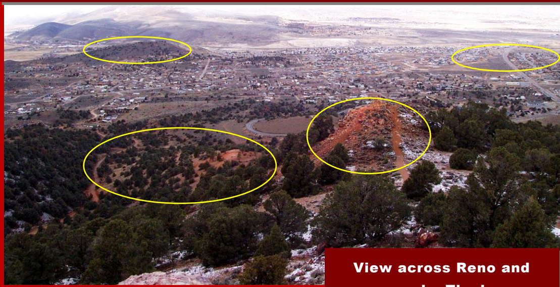
View across Reno and surrounds. The larger HSEs are circled.

These alunite and replacive quartz bodies are heavily sulphidic (enargite noted in those in the suburbs of Reno).