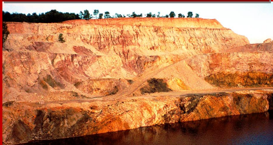
Abandoned Glen Eva Pit