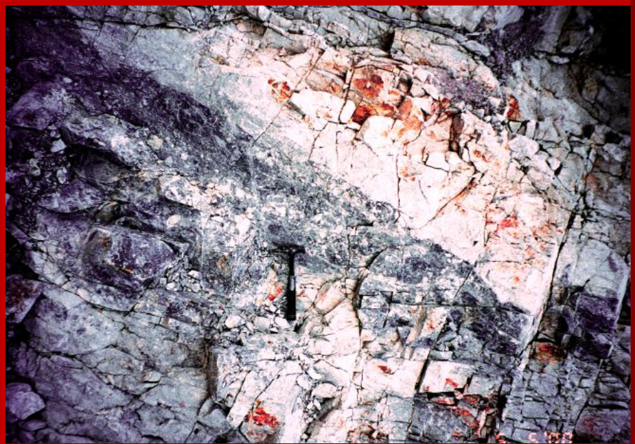
Mineralisation imposed upon extensive sinters